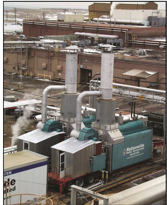
Pictured above: Two (2) Nationwide Boiler 70,000 lb/hr, 300 psig mobile boilers with EconoStak economizers installed for increased fuel efficiency and lower GHG emissions.