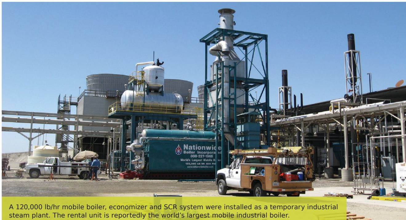
A 120,000 lb/hr mobile boiler, economizer and SCR system were installed as a temporary industrial steam plant. The rental unit is reportedly the world's largest mobile industrial boiler.