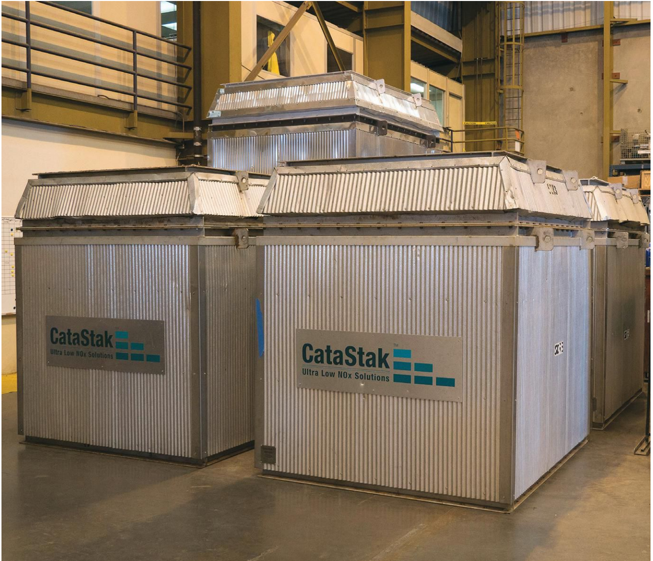
Ultra-low NO x emissions can be achieved with the use of selective catalytic reduction (SCR) technology. This methodology is post combustion and uses a single-reactor unit, catalyst and a reducing-agent delivery system.

mation often is a requirement for reporting purposes.