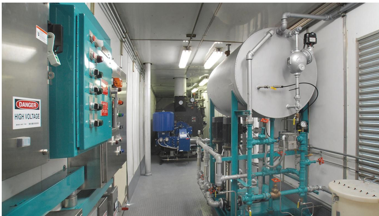
An internal view of a complete mobile boiler room shows how in such systems all necessary auxiliary equipment is provided.

In installations where a fully packaged mobile steam plant is not suitable or required for a specific application, a rental boiler can be provided as a stand-alone system. It also can be provided with a combination of the required auxiliary equipment