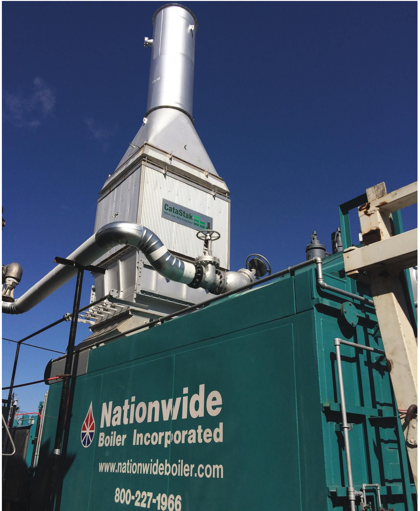
At the tomato-processing facility, the rental system includes an SCR system for emissions control to meet air permitting requirements.