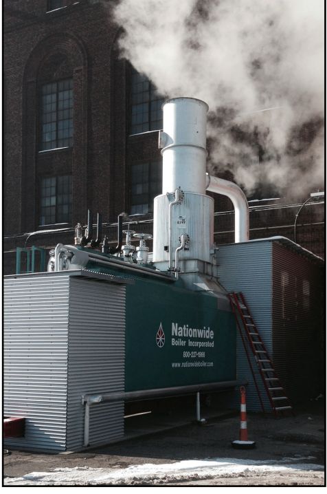
82,500 lb/hr Trailer-Mounted Rental Boiler and EconoStak Economizer Surviving the Cold

boiler with an EconoStak economizer. The boiler was dispatched in early November from Nationwide's partner storage yard in Bessemer, AL and traveled north for two days. National Boiler Works, Nationwide Boiler's representative conveniently located in the Midwest, helped with installation and start-up.