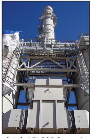
CataStak™ SCR System for Hot Oil Fired Heater

It was just over ten years ago when the CataStak<sup>™</sup>, a selective catalytic reduction (SCR) system capable of reducing NOx emissions to levels below 5 ppm, was introduced by Nationwide Boiler. Today, we have surpassed over 100 SCR projects throughout the nation.