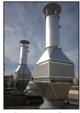
Dual Ammonia-Free CataStak™ SCR's

In addition, the successful startup of a dual Ammonia-free CataStak™ SCR project was recently completed for a cogeneration plant for the County of Los Angeles. This CataStak retrofit reduced NOx levels to less than 5 ppm on the two existing 50,000 lb/hr boilers.