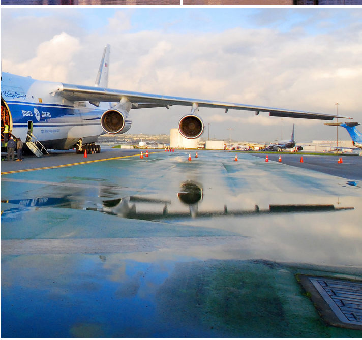
Air Shipment to Australia on the Antonov AN-124 Plane