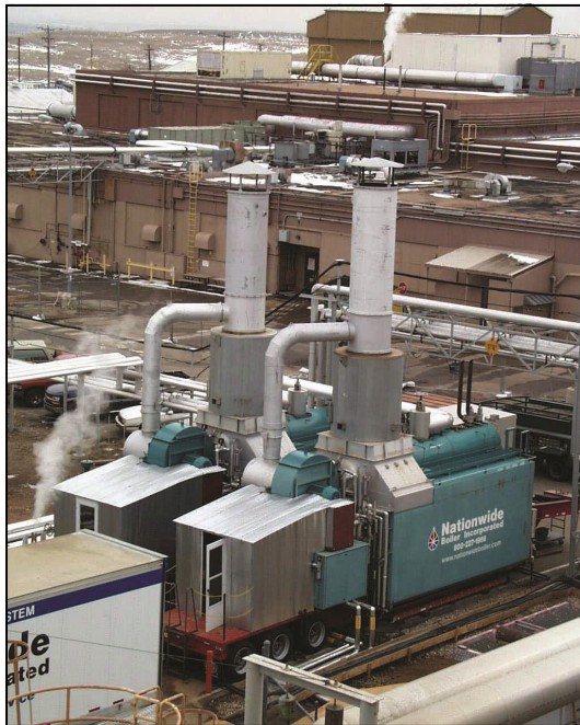
Pictured above: Two (2) Nationwide Boiler 70,000 lb/hr, 300 psig mobile boilers with EconoStak economizers installed for increased fuel efficiency and lower GHG emissions.