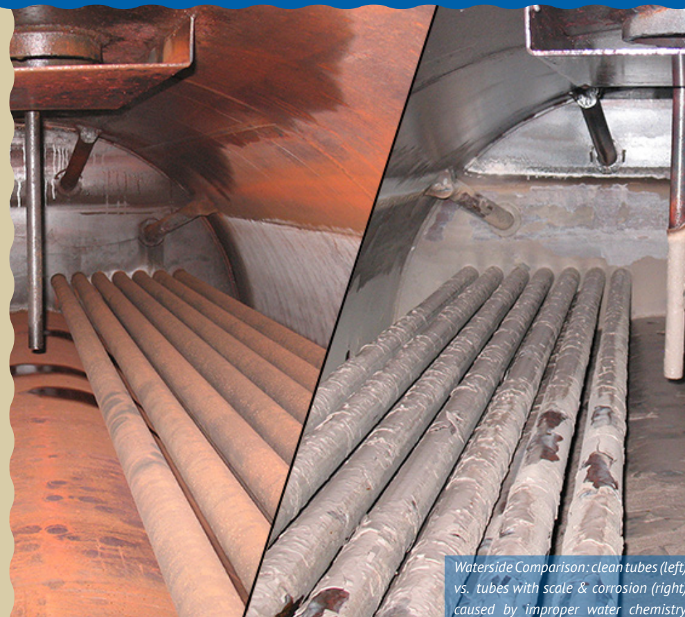
Waterside Comparison: clean tubes (left) vs. tubes with scale & corrosion (right) caused by improper water chemistry.