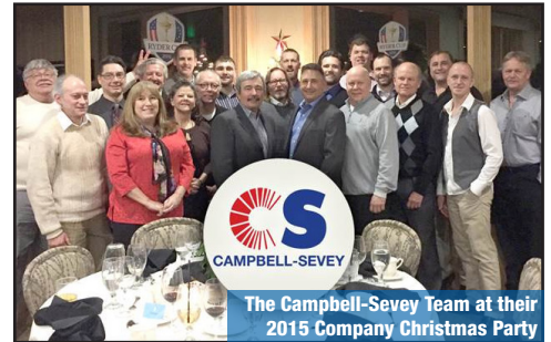
The Campbell-Sevey Team at their 2015 Company Christmas Party