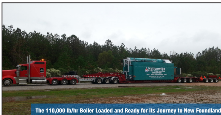
The 110,000 lb/hr Boiler Loaded and Ready for its Journey to New Foundland

With some minor changes to the offering and smooth negotiations, a final decision was made and the 110,000 lb/hr boiler was purchased by the customer. Shipping from the B&W factory in West Point, MS, the 135 foot trailer made the long haul from Mississippi to Ontario and through Quebec to board a barge in Nova Scotia. From there, it cruised to its final destination of New