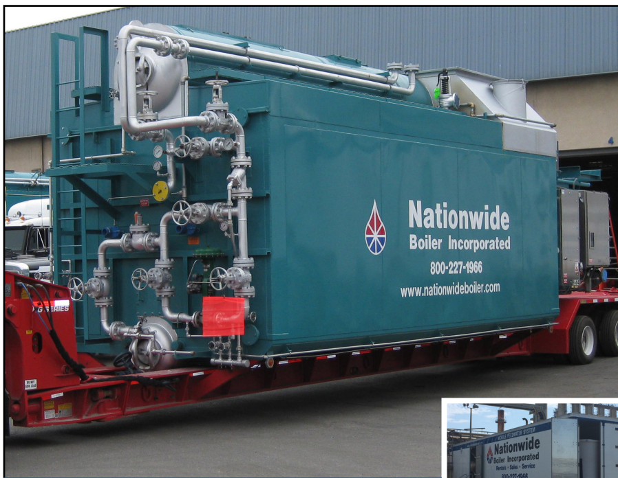
Nationwide Boiler's 82,500 lb/hr Trailer-Mounted Boiler Ready to Ship (top) and Mobile Feedwater System (right) at a Petroleum Refinery on the West Coast