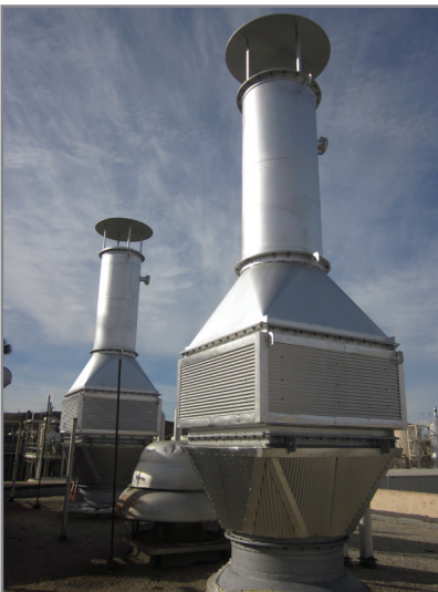
Two CataStak SCR systems installed on the roof of the steam plant.

After several site visits and a complete engineering design process, the SCR equipment was fabricated to facilitate the installation of the SCR reactor housing, duct work, and support frames on each boiler's stack, resulting in removal of the top portion of each stack for optimum catalyst placement. California Boiler Inc. was sub-contracted to install the equipment.