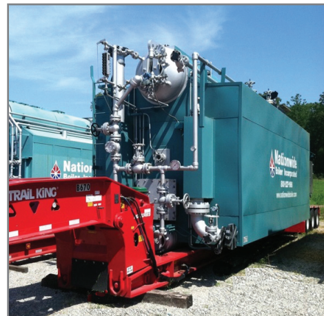
Babcock & Wilcox Boilers Ready for Sale or Rent.

Since Nationwide Boiler's inception almost 50 years ago, the company remains committed as the single source provider for boiler rentals, and sales of new and reconditioned equipment. It is further evident through Nationwide Boiler's continued progress in bringing ultra low NOx and energy efficient solutions to market. Products including